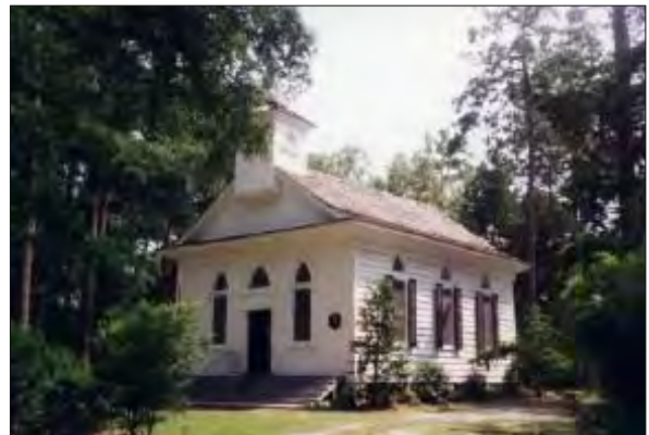
Mount Lebanon Chapel

Mount Lebanon Chapel is the first property on Airlie Road to be recognized on the National Register of Historic Places and currently resides on the grounds of Airlie Gardens. xi It was accepted to the register in October of 1986. Built in 1835, Mount Lebanon Chapel is an example of Greek Gothic Revival architecture. xii Years after its original construction, vandals destroyed a considerable portion of the structure; however, in 1973 a restoration project revitalized Mount Lebanon Chapel to become the living monument