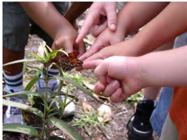
Wildlife at Airlie Gardens

There is an abundance of wildlife species in the Airlie Road vicinity. They compile a vast part of the natural setting along the roadway. In March of 2008, Airlie Gardens received National Wildlife Federation Status. It is now an official Certified Wildlife Habitat site. The property attracts a variety of birds, butterflies and other wildlife while helping to protect local environment. In order to be recognized and certified, the property must provide four basic elements that all wildlife need: food, water, cover and places to raise offspring. The property must also employ sustainable gardening practices. xxxi