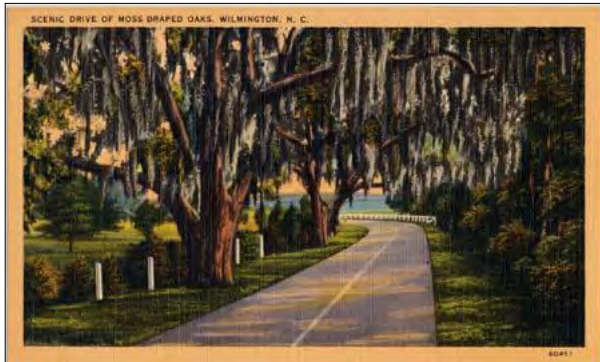
Postcard depicting "moss draped oaks" in the vicinity of the Intracoastal Waterway

Airlie Gardens (300 Airlie Road), a public park, is located 0.2 miles from the route’s origin and