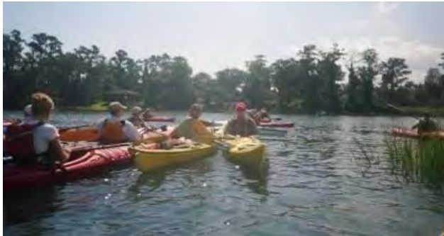
Kayak tour at Airlie Gardens

trips are also available for local schools to teach students about the environment through hands-on experiences in the field. Public programs are offered on a diverse assortment of concepts ranging from water quality to eco-friendly landscaping. Adjacent water bodies including Bradley Creek and the Atlantic Intracoastal Waterway are used to conduct educational kayak tours, where tourists float through tidal creeks and marsh areas while discussing ecology and wildlife. xxviii