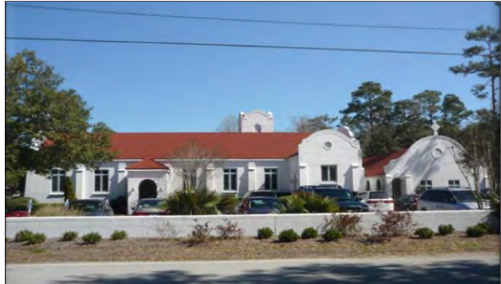
Saint Andrew’s On-the-Sound

Scattered along the corridor are several architecturally significant structures. The most intriguing of these is the Saint Andrew’s On-the-Sound, Episcopal Church which was built in 1923. This Spanish Mission-style architecture is uncommon in the Wilmington area, contributing appreciably to corridor’s overall scenic beauty and uniqueness.