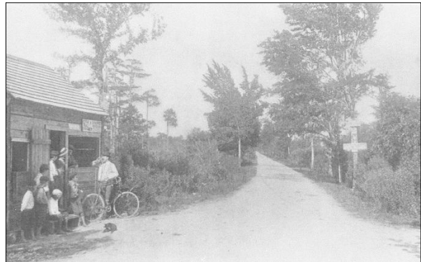
A toll house on Shell Road circa 1898

On March 10, 1875, the North Carolina General Assembly voted to form the Wilmington & Coast Turnpike. A local newspaper article, dated March 1874 indicates that the General Assembly created the turnpike to provide the motivation and authority necessary to construct what would become the last section of "the connecting link between the mountains and the seashore". xix With the turnpike established, a few local enterprising citizens began to envision and