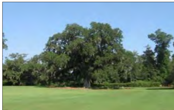
The Airlie Oak

Sometime around 1550, the Airlie Oak began to take root in what is now known as Airlie Gardens. In 1937, author of "Carolina Gardens," E.T.H. Shaffer wrote: "Certain live oaks at Airlie stand among the largest specimens of the noble tree to be found anywhere in the Carolinas. Here they grow so fast and magnificent, bending their long gnarled arms down protecting over the garden as though they too loved it" xxiii Today, the Airlie Oak is