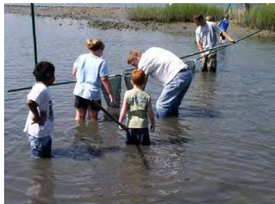
Educational activities at Airlie Gardens

The most noteworthy educational resource of the Airlie Road corridor is Airlie Gardens. A considerable part of the garden’s mission is to provide educational opportunities for the public regarding nature and the environmental issues currently facing southeastern North Carolina’s coast. Summer camps are currently offered to provide age-appropriate fun and environmental education. Field