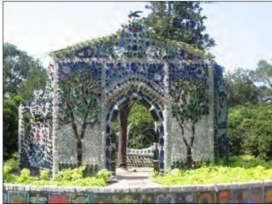
The Bottle Chapel at Airlie Gardens

more than 460 years old and a staple for visitors to the gardens. The Airlie Oak is also recognized by the North Carolina Forest Service as the largest of its species in the region with a trunk circumference of about 21 feet and a crown of approximately 104 feet. In August of 2007, the Airlie Oak was selected as Wilmington’s first “heritage tree”. The Heritage Tree program is administered by the Wilmington Tree Commission, seeking to identify and catalog the Port City’s most significant trees and protect them from harm. Trees are nominated based upon exceptional size, form or rarity, historical significance, landmark quality, and trees in notable cohesive groves. xxiv