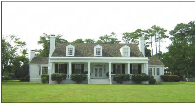
Gabriel's Landing (a.k.a Old Oak Point)

A year following the acceptance of Mount Lebanon Chapel to the National Register of Historic Places, the Bradley-Latimer Summer House also joined the list as the second historically significant structure identified on the Airlie Road corridor. The Bradley-Latimer Summer House is situated in a grove of native live oak trees overlooking Bradley Creek adjacent to Airlie Gardens. Constructed in 1855, the house is a rare surviving example of the Antebellum Civil War architecture that emerged as properties along the sound were converted from agriculture or salt production purposes to quiet summer retreats. The summer house is thought to have been constructed by Richard Bradley, Jr., who less than a year after its completion sold it to Zebulon Latimer, giving it the Bradley-Latimer name. No specific architectural style is referenced in register documents; however, they do describe the property as a one-story structure with an open floor plan and breezeways designed for residents to take advantage of summer breezes in the shade away from the mosquitoes of Bradley Creek.