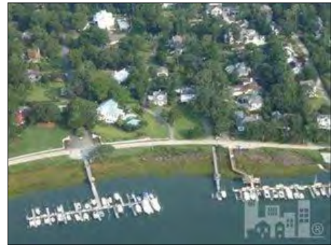
Oblique aerial image of Airlie Road adjacent to the Intracoastal Waterway

The Airlie Road Scenic Byway is a picturesque route from beginning to end nestled between Bradley Creek and the Atlantic Intracoastal Waterway in Wilmington, North Carolina. Airlie Road’s scenic qualities are embodied in the natural surroundings and diverse architectural character. Residents and visitors begin their journey beneath the indigenous pines and live oaks on a historic concrete paved street. Along the route, travelers experience low country wetland and pastoral vistas,